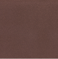
Rusty Angel - 09